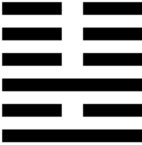
No. 36 Darkening of the Light