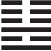
No. 36 Darkening of the Light